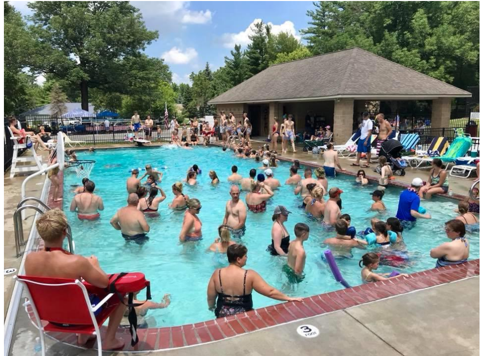
Keep cool this summer by becoming a regular visitor to the Wellington North neighborhood pool!